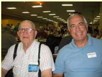
K8VW & K8DSS

I'm sure we got all of your pictures in the above photo. You might have to blow it up and squint to see yourself. Wish I had more close-ups to share.