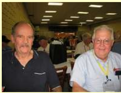
ND8R & WB8M