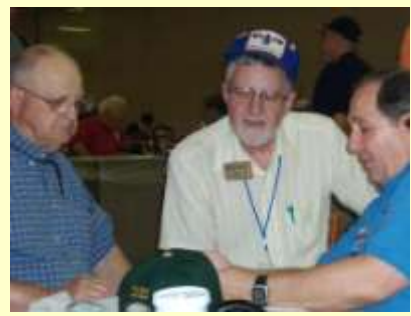
W9AYJ, W4XKE & K3HK